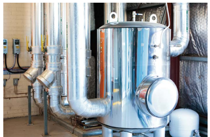
Figure 2: Chilled water buffer vessel at 4 Mort Street, Canberra