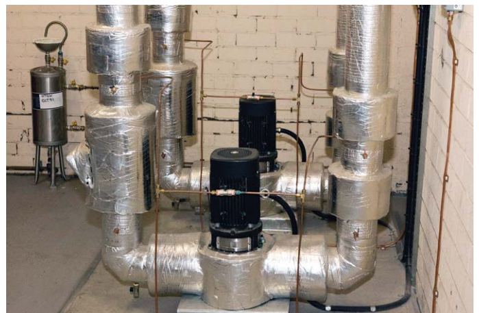
Figure 4: Insulated heating hot water pump and pipe work at 4 Mort Street.

The design engineers faced practical challenges including restrictive ceiling void spaces, which made access and system design more difficult. Conventional methods for implementing some of the measures listed above, including the installation of new VAV terminal units and diffusers were not practical. Innovative means had to be designed and carefully installed to achieve the necessary gains in efficiency. Further details are provided in four technical factsheets that accompany this case study.