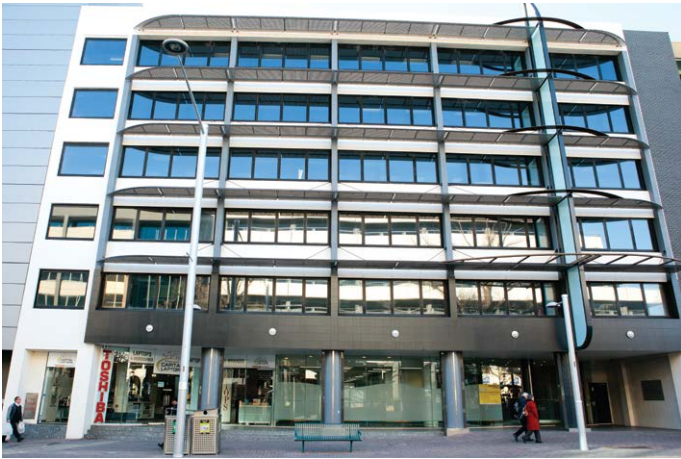
Figure 1: Street view of 4 Mort Street, Canberra

In 2010, 4 Mort St, Canberra (Figure 1) was upgraded to significantly improve its energy performance. The retrofit was performed with the dual constraints of a limited budget and the building remaining occupied during the upgrade. This Case Study covers the key factors that enabled this 45 year old commercial office building to achieve a 2.5 star increase to 4.5 star NABERS Energy Rating, including the pathway taken and the technologies used.