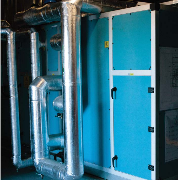
Figure 3: Air Handling Unit at 4 Mort Street, Canberra